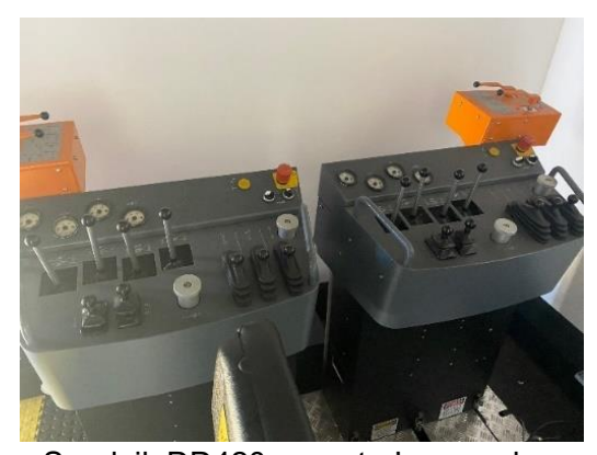
Sandvik DD420 operator's console