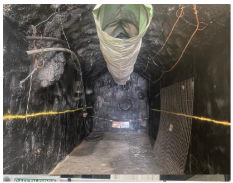
Underground mine taining area